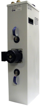
NO DAMAGE TO THESE UNITS! (1 Pump Housing Style) 5 Year Warranty