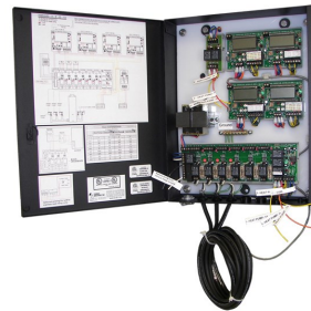
HSS® Control Packages