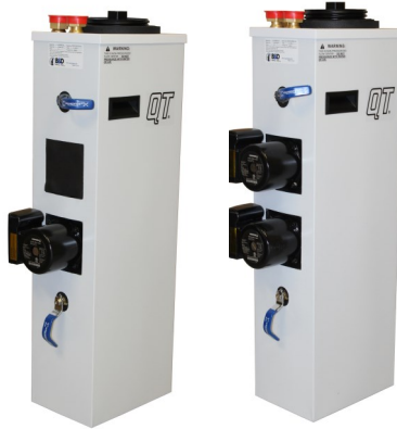
SMALL DAMAGE TO THESE UNITS CAN BE BUILT AS A 1-230QFC OR 2-230QFC 5 Year Warranty