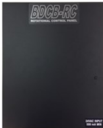
HSS® Rotational Control Packages

ALL HSS® BUFFER TANKS & HSS® AIR HANDLERS PURCHASED AFTER MARCH 1, 2020 HAVE A 5 YEAR WARRANTY.