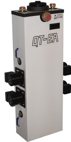
DAMAGE TO THIS UNIT CAN BE BUILT AS A 2, 3 OR 4 Pump Unit 2 Year Warranty