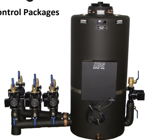
HSS® Buffer Tank