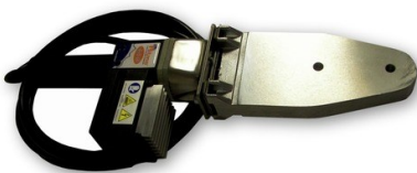
RT-1-H Socket Fusion Iron (115V)