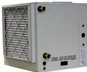
HSS® Air Handlers